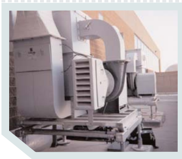
PURAFIL TUB SCRUBBER SYSTEM