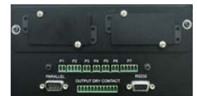
Smart Slots and Interface